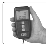
Comfortable handheld control