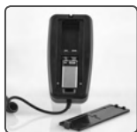
Runs on one (included) or two 9V batteries