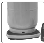
Stable 3 point base