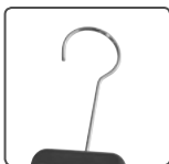
360° Swivel hanger hook